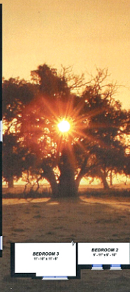
Second Floor Plan B