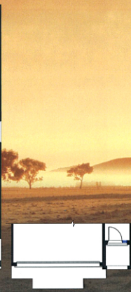
Ground Floor Plan B